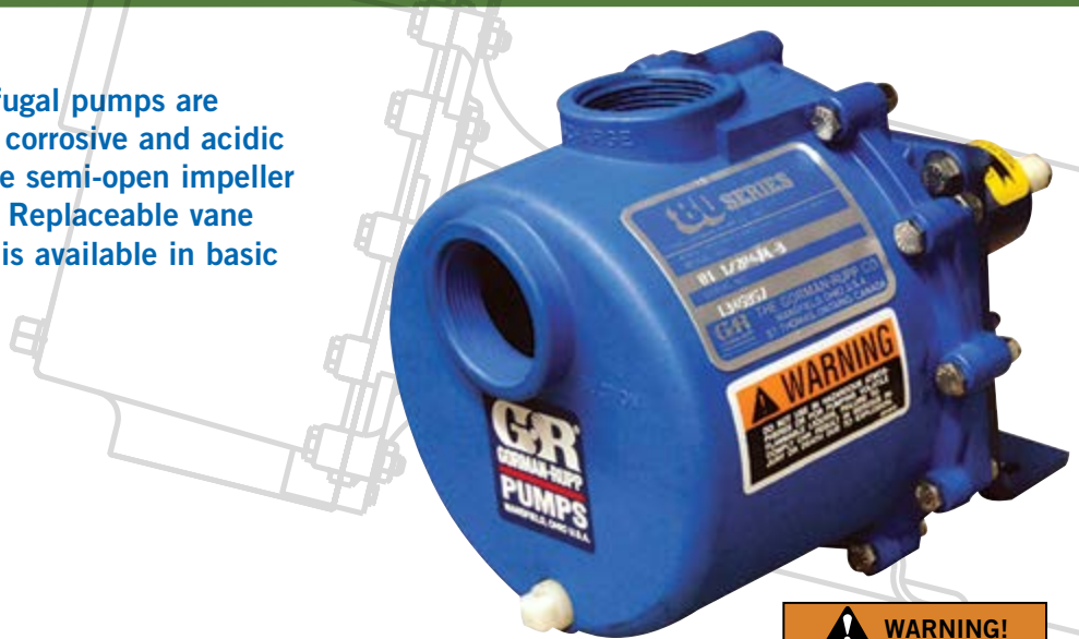
Model: 81 1/2P47A-B

Gorman-Rupp self-priming centrifugal pumps are designed for use with a variety of corrosive and acidic liquids containing mild solids. The semi-open impeller handles solids to 9/16" diameter. Replaceable vane plate and flow guide. This model is available in basic or close-coupled configurations.