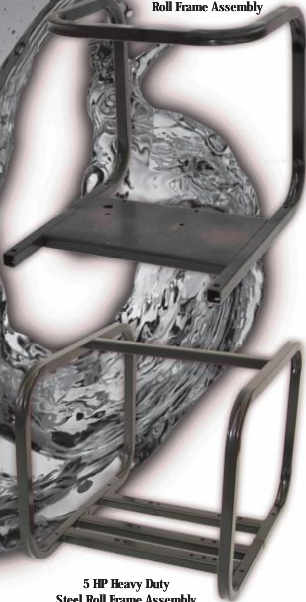
5 HP Heavy Duty Steel Roll Frame Assembly