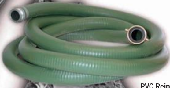
PVC Reinforced Suction Hose