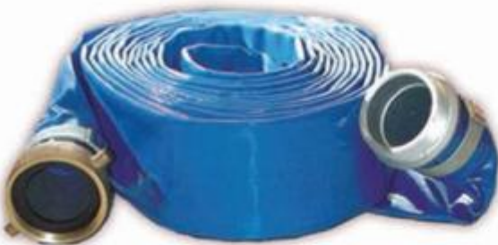
PVC Flexible Discharge Hose