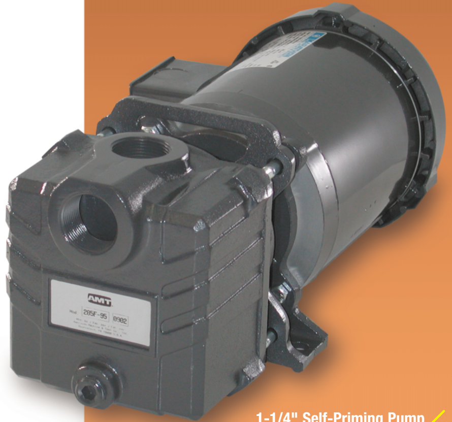
1-1/4" Self-Priming Pump

The AMT Self-Priming Cast Iron Centrifugal pumps are designed for circulating, boosting, washdown, liquid transfer and dewatering applications. Dual volute design reduces radial load on motor. The centerline discharge feature is specifically designed to prevent vapor binding and makes for convenient piping connections. All models are fitted with self-cleaning, semi-open impellers. The units will self-prime to 20 Ft. Mounting bases feature 7/16" mounting holes which are 6" OC (on center). Built in carrying handles offer portability.